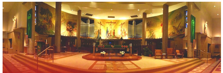
St. Clair of Montefelco