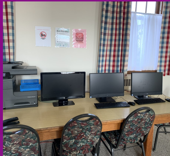
Resident Study Area