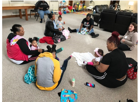
Mommy and Me Class

Child development and expectations ; child bonding; normal range of sleep, rest, activity and crying patterns; as well as communication skills and discipline are discussed during an 8-week series on "Parenting" presented by an Ascension–St. John Providence Hospital instructor.