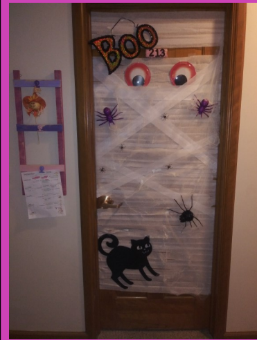
Winner– Door Decorating Contest

And last but certainly not least, we are happy to announce Gianna House's collaboration between its Community Outreach and Residential program by hosting our first Mommy & Me sleepover. This invite only event was presented to community outreach moms and their pre-teen daughters between the ages of 9-13 years of age. Our residents will also participate and serve as mentors as we strive to help strengthen the bond between moms and daughters, assist the daughters with coping with hormonal changes, transitioning from middle to high school, identity crisis, bullying and much more.